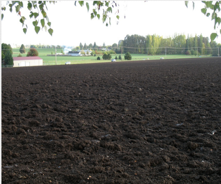
Willamette Silt Loam soil (Helvetia Road)