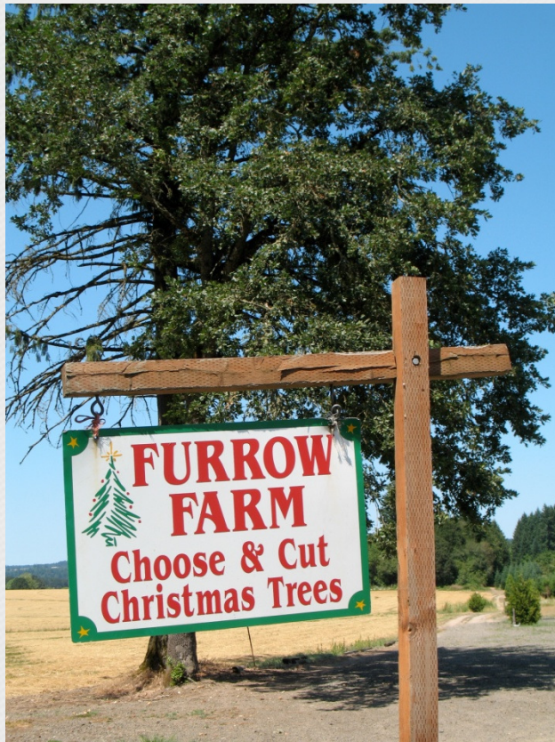
(West Union Road, Helvetia)