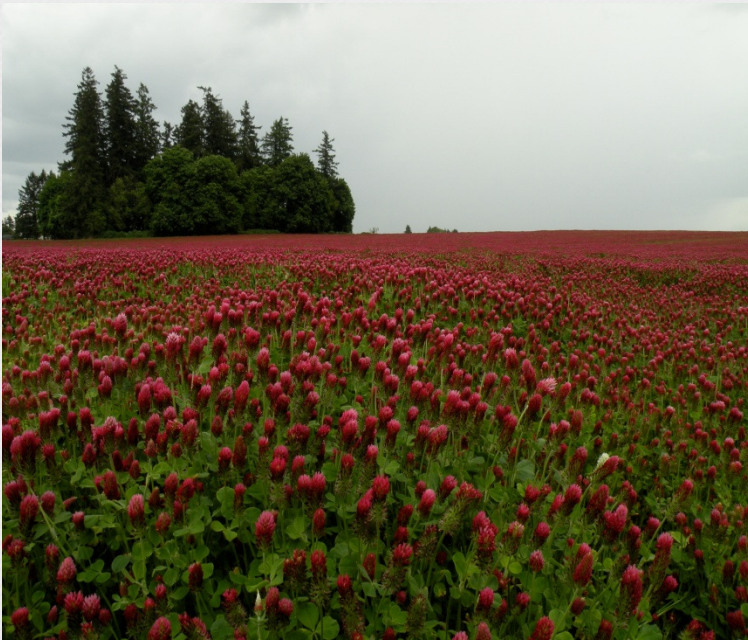
Red clover (Helvetia Road)