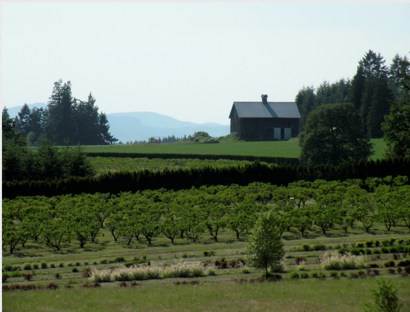
Nursery stock – trees West Union Road (Helvetia)