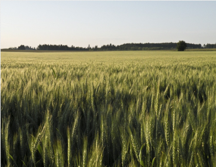
Wheat fields (West Union Road, Helvetia)