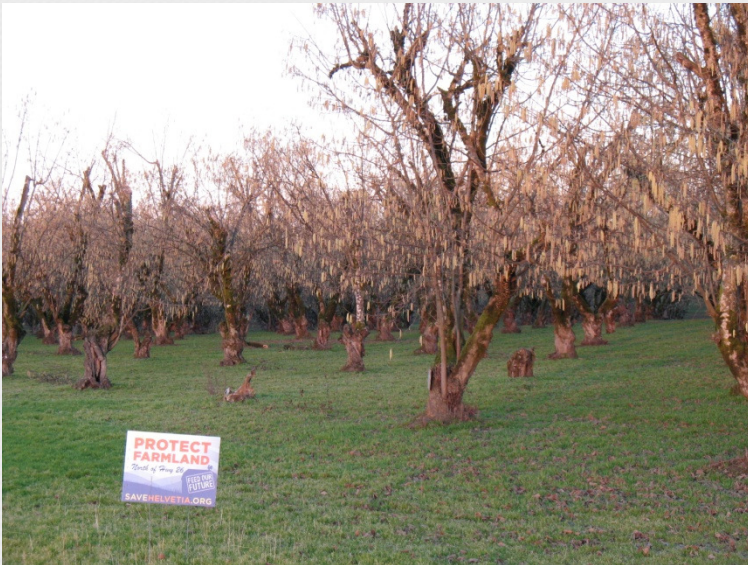
Hazelnut orchard (Groveland Road, Helvetia)